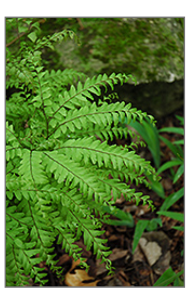
Northern Maidenhair Fern foliage

Northern Maidenhair Fern will grow to be about 18 inches tall at maturity, with a spread of 24 inches. Its foliage tends to remain dense right to the ground, not requiring facer plants in front. It grows at a slow rate, and under ideal conditions can be expected to live for approximately 15 years. As an herbaceous perennial, this plant will usually die back to the crown each winter, and will regrow from the base each spring. Be careful not to disturb the crown in late winter when it may not be readily seen!