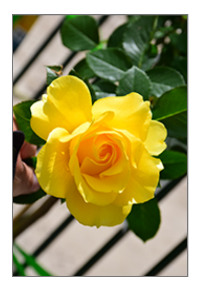
Sparkle And Shine Rose flowers