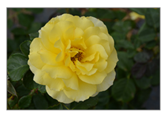
Sparkle And Shine Rose flowers