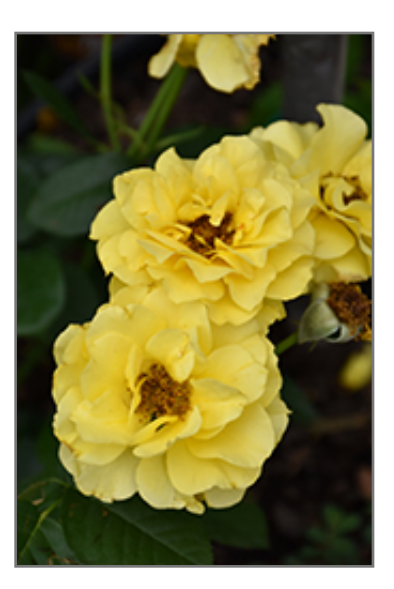
Sparkle And Shine Rose flowers

This shrub should only be grown in full sunlight. It does best in average to evenly moist conditions, but will not tolerate standing water. It is not particular as to soil type or pH. It is highly tolerant of urban pollution and will even thrive in inner city environments. This particular variety is an interspecific hybrid.