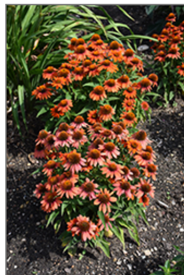
Sombrero Adobe Orange Coneflower in bloom