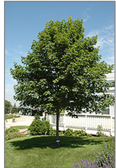
Fall Fiesta Sugar Maple

This tree should only be grown in full sunlight. It prefers to grow in average to moist conditions, and shouldn't be allowed to dry out. It is not particular as to soil pH, but grows best in rich soils. It is somewhat tolerant of urban pollution. This is a selection of a native North American species.