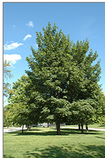
Norwegian Sunset Maple

Our Growing Place Choice plants are chosen because they are strong performers year after year, staying attractive with less maintenance when planted in the right place.