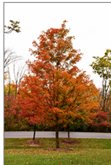
Norwegian Sunset Maple in fall