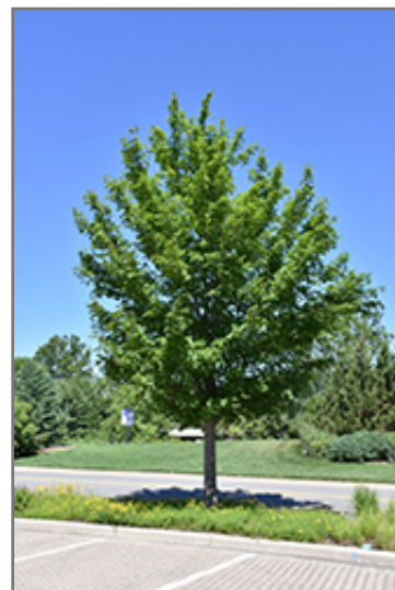
State Street Miyabe Maple

State Street Miyabe Maple will grow to be about 40 feet tall at maturity, with a spread of 25 feet. It has a high canopy with a typical clearance of 6 feet from the ground, and should not be planted underneath power lines. As it matures, the lower branches of this tree can be strategically removed to create a high enough canopy to support unobstructed human traffic underneath. It grows at a medium rate, and under ideal conditions can be expected to live for 80 years or more.