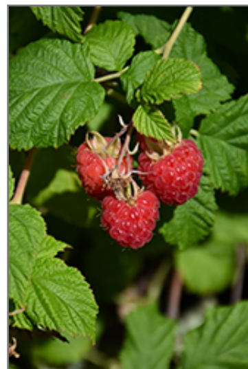
Raspberry Shortcake Raspberry fruit

Raspberry Shortcake Raspberry has rich green deciduous foliage on a plant with an upright spreading habit of growth. The textured oval compound leaves do not develop any appreciable fall color. It features an abundance of magnificent red berries in mid summer.