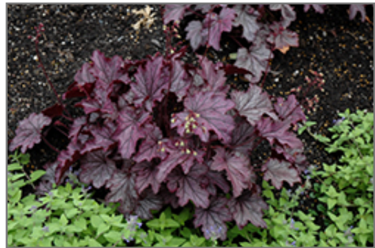
Spellbound Coral Bells