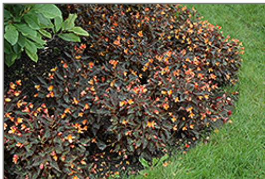
Sparks Will Fly Begonia in bloom