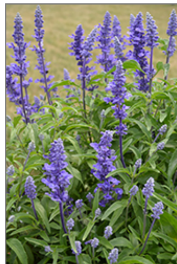
Victoria Blue Salvia flowers

Victoria Blue Salvia is recommended for the following landscape applications;