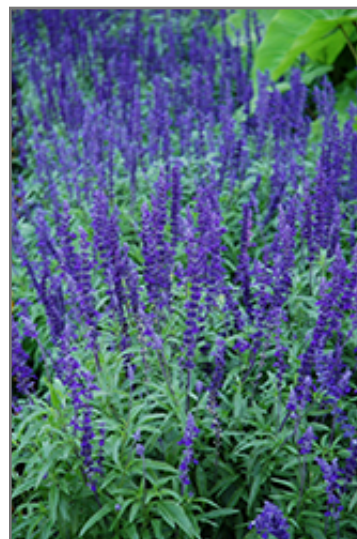
Victoria Blue Salvia flowers

Victoria Blue Salvia is a fine choice for the garden, but it is also a good selection for planting in outdoor pots and containers. With its upright habit of growth, it is best suited for use as a 'thriller' in the 'spiller-thriller-filler' container combination; plant it near the center of the pot, surrounded by smaller plants and those that spill over the edges. Note that when growing plants in outdoor containers and baskets, they may require more frequent waterings than they would in the yard or garden.