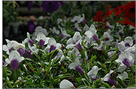
Grape-O-Licious Torenia flowers