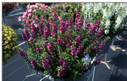
Archangel Raspberry Angelonia in bloom