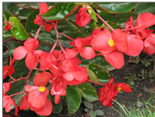
Dragon Wing Red Begonia flowers

Dragon Wing Red Begonia is an herbaceous annual with a trailing habit of growth, eventually spilling over the edges of hanging baskets and containers. Its medium texture blends into the garden, but can always be balanced by a couple of finer or coarser plants for an effective composition.