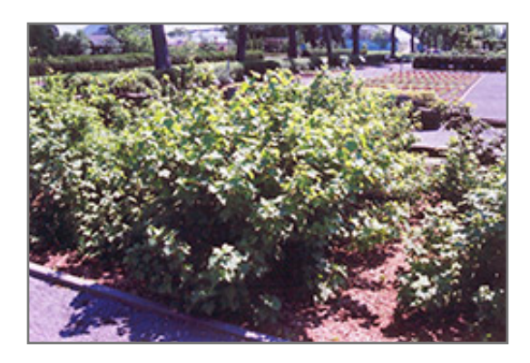
Consort Black Currant