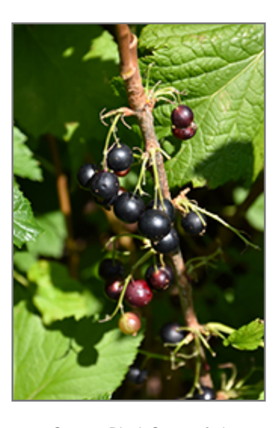
Consort Black Currant fruit

This is a dense herbaceous deciduous shrub with a more or less rounded form. Its relatively fine texture sets it apart from other landscape plants with less refined foliage. This plant will require occasional maintenance and upkeep, and is best pruned in late winter once the threat of extreme cold has passed. It is a good choice for attracting birds to your yard. It has no significant negative characteristics.