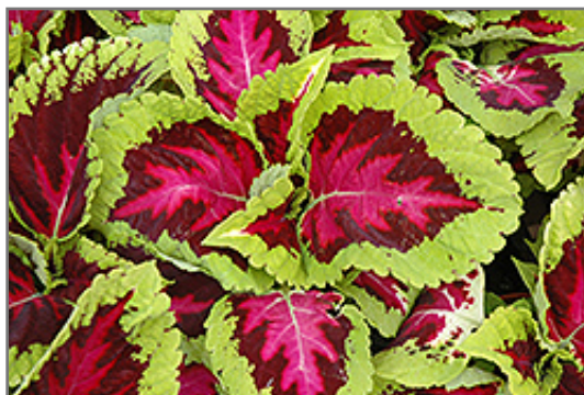
Kong Rose Coleus foliage