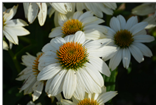
PowWow White Coneflower flowers

This is a relatively low maintenance plant, and is best cleaned up in early spring before it resumes active growth for the season. It is a good choice for attracting birds and butterflies to your yard, but is not particularly attractive to deer who tend to leave it alone in favor of tastier treats. It has no significant negative characteristics.