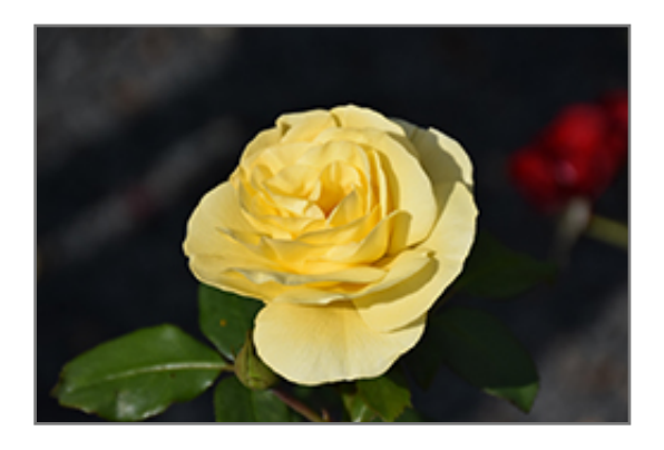
High Voltage Rose flowers