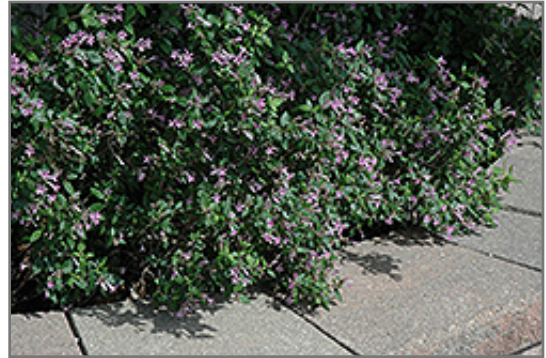
Leptodermis in bloom

This shrub does best in full sun to partial shade. It prefers to grow in average to moist conditions, and shouldn't be allowed to dry out. It is not particular as to soil type or pH. It is somewhat tolerant of urban pollution. This species is not originally from North America.