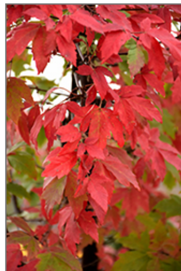
Paperbark Maple in fall

This tree does best in full sun to partial shade. It prefers to grow in average to moist conditions, and shouldn't be allowed to dry out. It is not particular as to soil type or pH. It is somewhat tolerant of urban pollution. This species is not originally from North America.