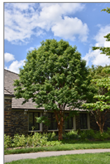
Paperbark Maple